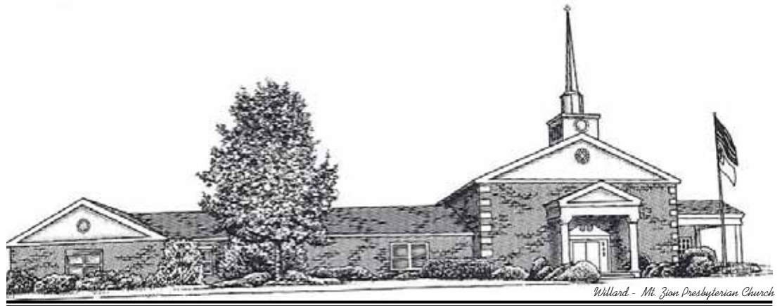
Willard - Mt. Zion Presbyterian Church

It is the mission of Willard-Mt. Zion Presbyterian Church to serve God, to reach out in love and care for our congregation, our community and the world; to be people who are Christ centered, fed by God's word and led by the Holy Spirit.